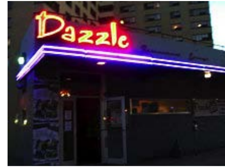
Dazzle Jazz Club