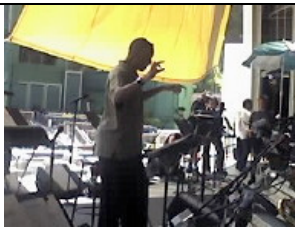
John Clayton conducts